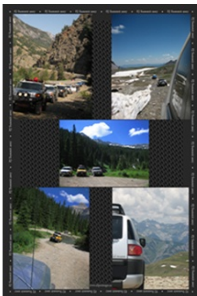
2007 FJ Summit