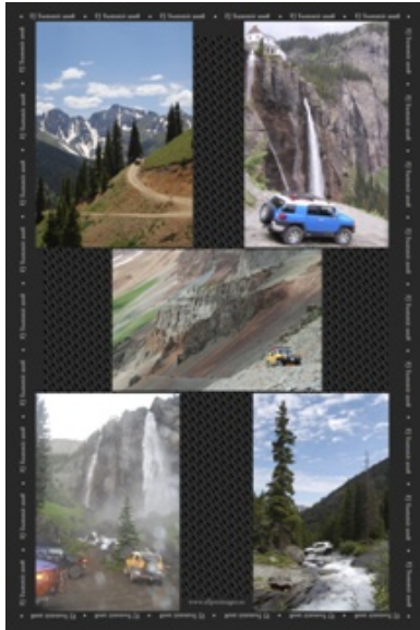
2008 FJ Summit

In addition to the FREE version of FJC Magazine, we offer several great FJ Cruiser posters. We're now very happy to announce that all of our back issues of FJC Magazine can be professionally printed and sent directly to your house.